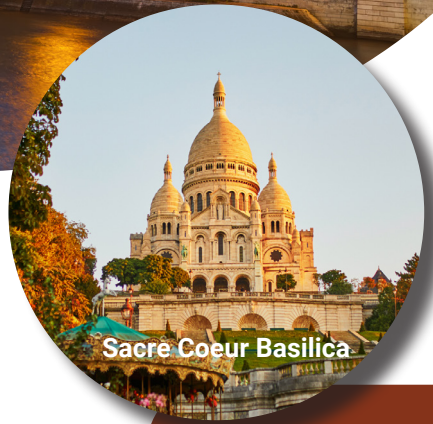
Sacre Coeur Basilica

“Share incredible moments of deep reflection, cultural discovery, and Spiritual Renewal! ”